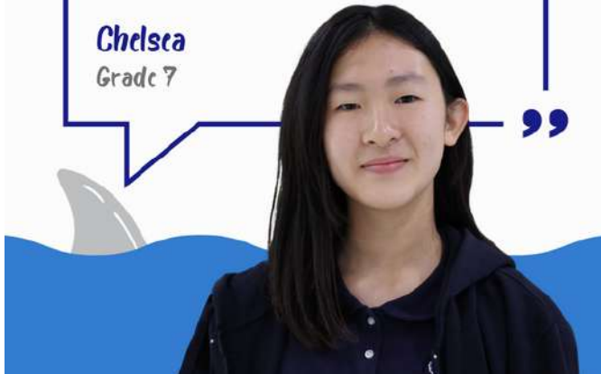
Chelsea Grade 7