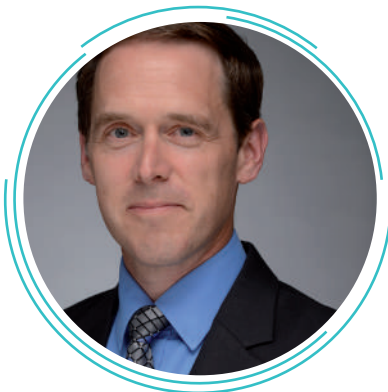
MIDDLE SCHOOL & HIGH SCHOOL PRINCIPAL