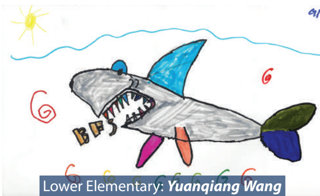
Lower Elementary: Yuanqiang Wang